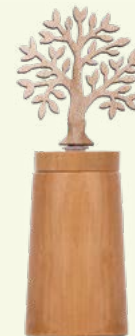
72210 Scent Tree