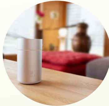
7018 Cool Breeze Diffuser