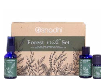
75103 Forest Walk Set