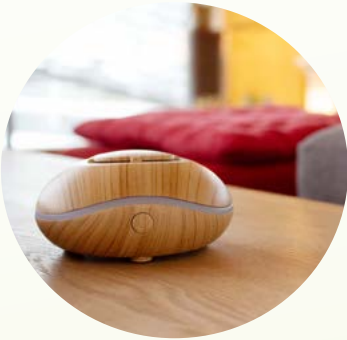
7029 Ambiance Diffuser