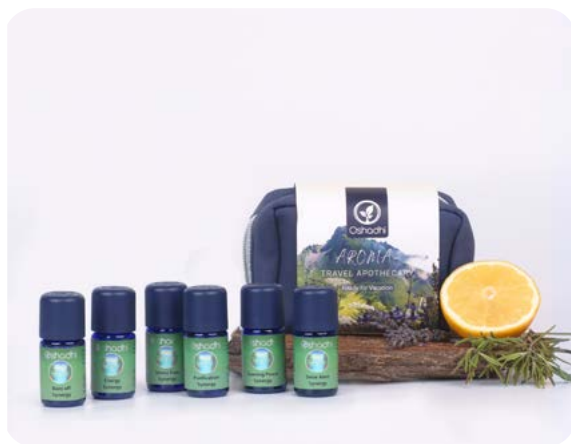
75312-30 Travel Apothecary