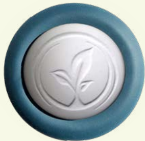
718011 Aroma stone Oshadhi with blue plate