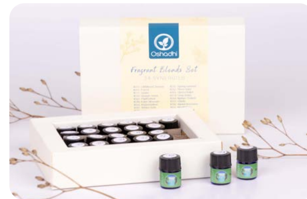
Synergy Tester Set