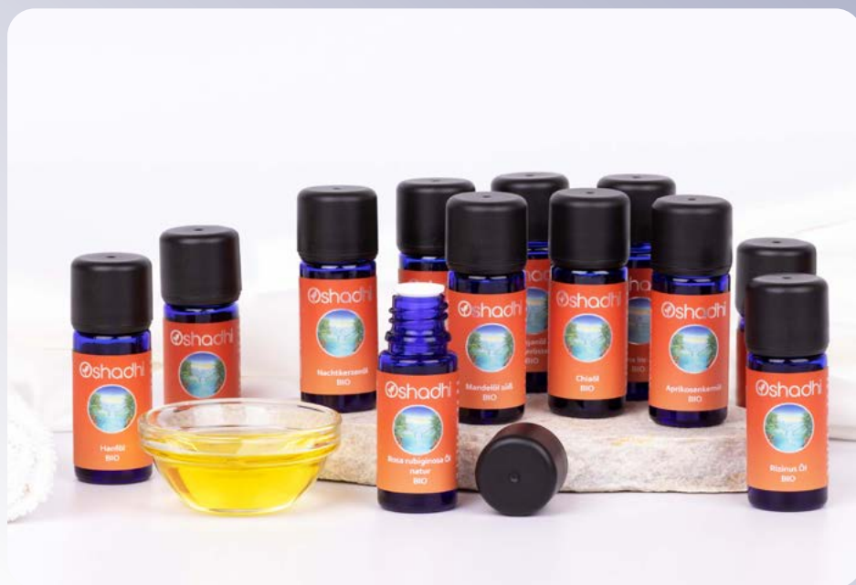
Carrier Oil Tester Set