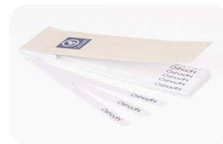
7075 Oshadhi Fragrance strips