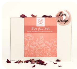
75104 For you Set