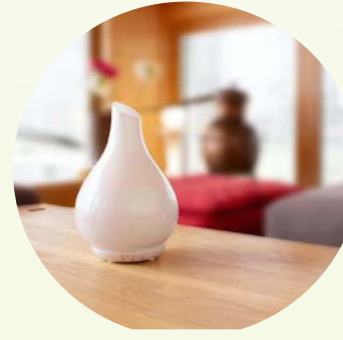
7064 Aroma Spa Ultrasonic Diffuser (pearl)