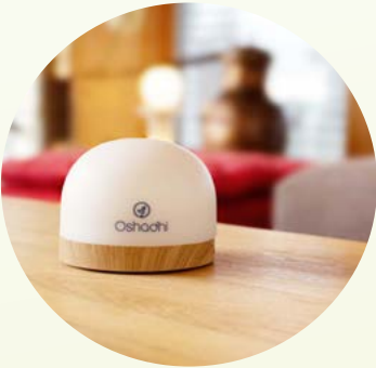
7016 Light Air Diffuser