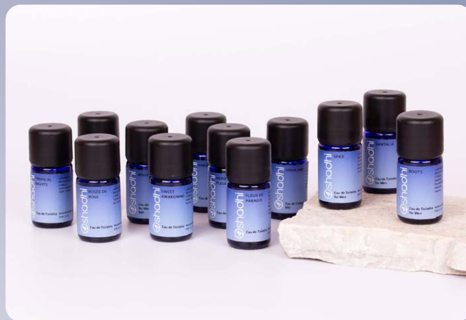
Eau de Toilette Tester Set