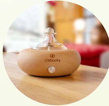
7020 Oshadhi Crystal Light Diffuser