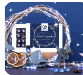
75201-24 Mini Advent Calender