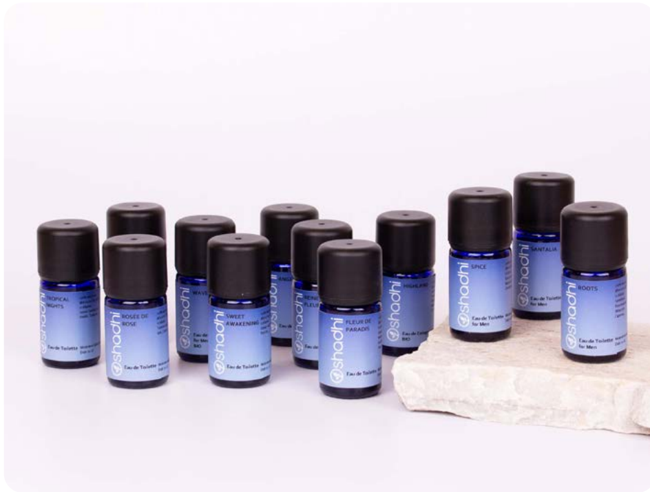
Eau de Toilette Tester Set