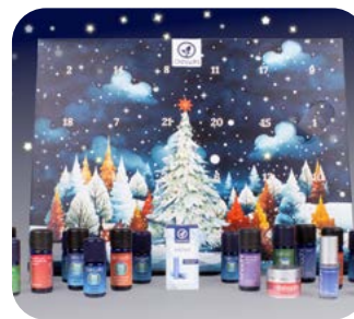
75205 Advent Calendar Treasures