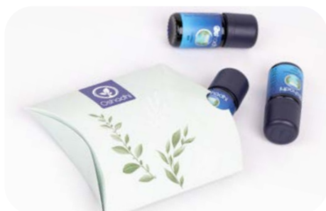
79225 Neutral gift box