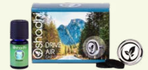
7080-5 Drive Air Diffuser and „Drive Alert“ Synergy, 5ml