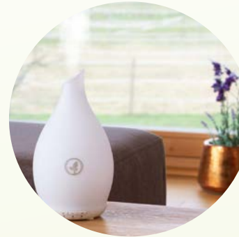
7063 Aroma Spa Ultrasonic Diffuser (white)