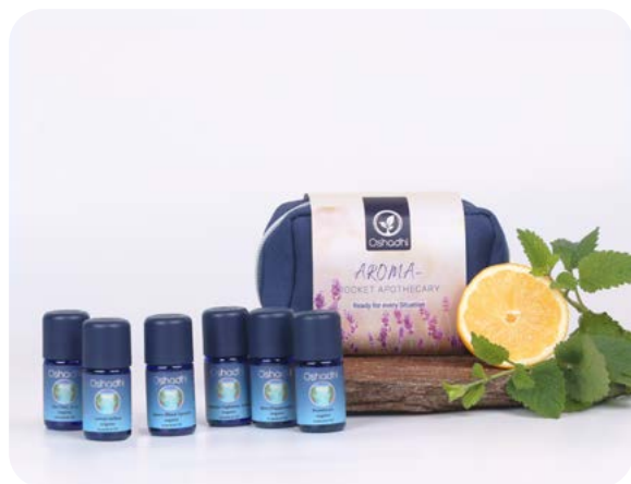
75311-30 Pocket Apothecary