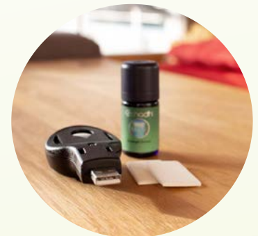
7085-5 USB Diffuser and „Orange Grove“ Synergy, 5ml