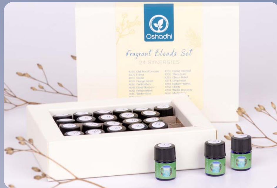
Synergy Tester Set