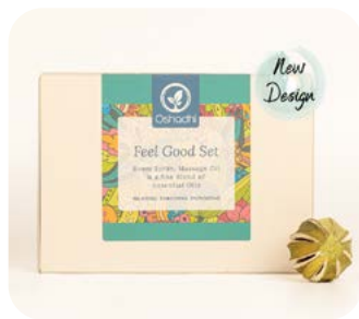
75102 Feel Good Set