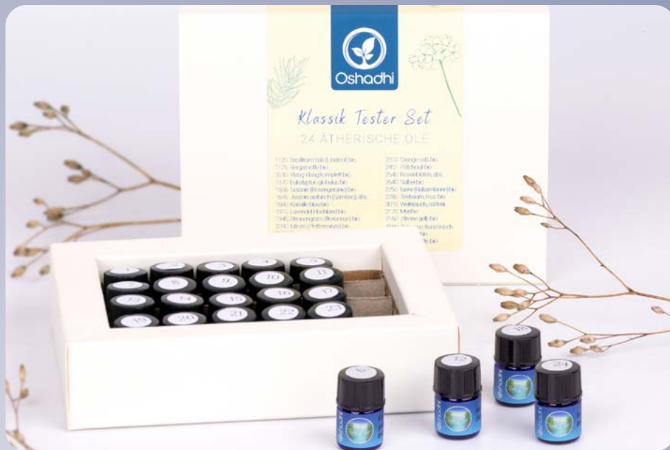
Essential Oil Tester Set