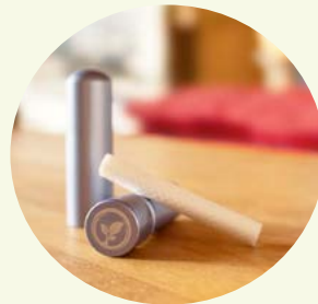
7066 Airôme Inhaler Stick