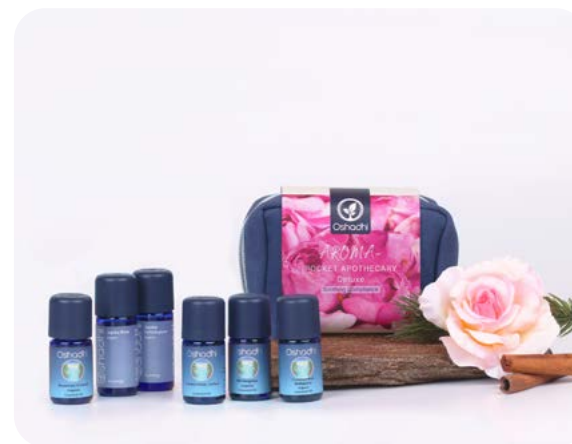
75313-40 Pocket Apothecary - DELUXE